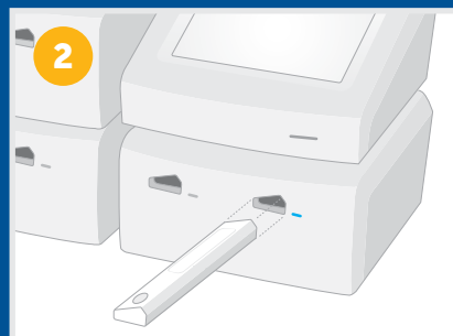
2 INSERT CARTRIDGE