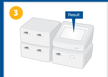
3 READ RESULT